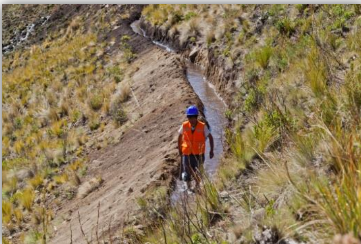
Community members digging an Irrigation channel, funded by Strike

The Company continued to support the local communities during the quarter, with economic and technical support towards a number of social and infrastructure initiatives. These included the digging of a new irrigation canal, construction of school sports fields, local churches and a local primary school. The Company also provided sponsorship for community Christmas festivities.