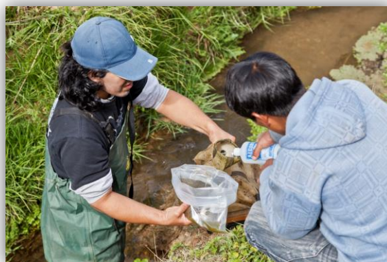
Fieldwork for Environmental Impact Assessment at Opaban